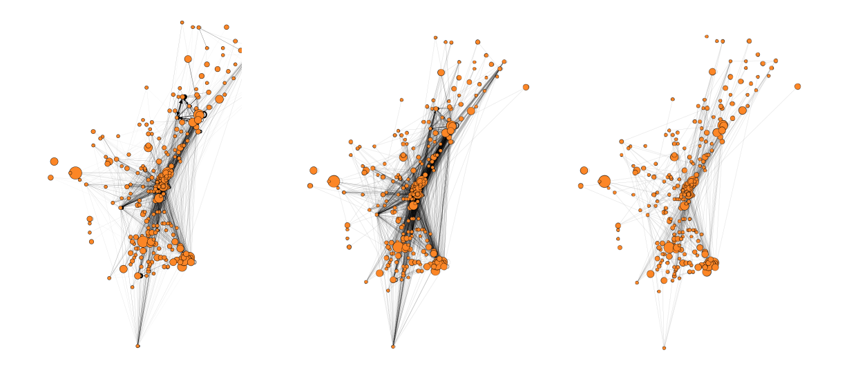
Figure 2: Production network of the autonomous region "Comunidad Valenciana." – direct and indirect connections. We aggregate firms on the zip-code level. The size of a node is proportional to the aggregate sales of all firms in the same zip-code location. The thickness of a link is proportional to the value associated to that link. For visibility we keep only links that are in the 90th percentile with respect to their value. The links in the leftmost figure indicate direct connections. The links in the middle network represent indirect connections of length 2 (the network whose adjacency matrix is \mathbf{G}^2 ). The links in the rightmost figure indicate that two nodes are not directly connected but are indirectly connected through a path of length 2. The layout is based on the geographical coordinates of the corresponding zip-code areas.